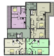
third floor plan